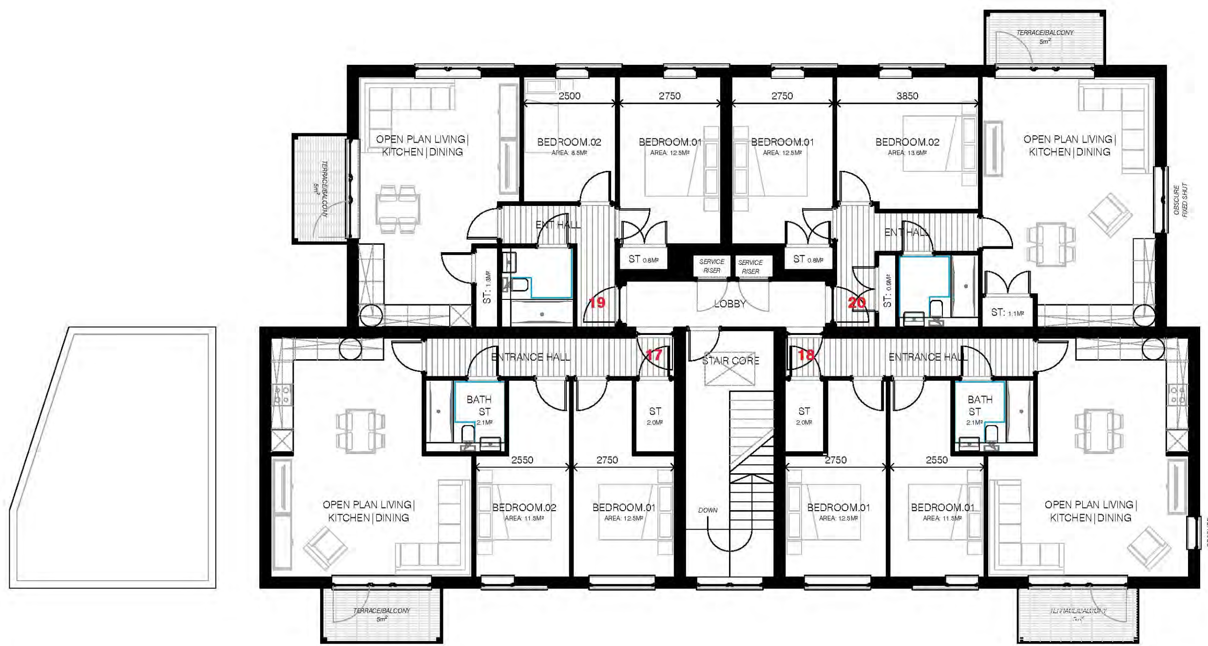
FLATS: PROPOSED SECOND FLOOR PLAN SCALE: 1:100@A1